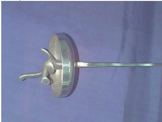
Epee with Visconti grip

Blade size is y10 and under must use 2 or smaller, other fencers may use any size, most common is size 5. Order Visconti grips. Specify right or left handed.